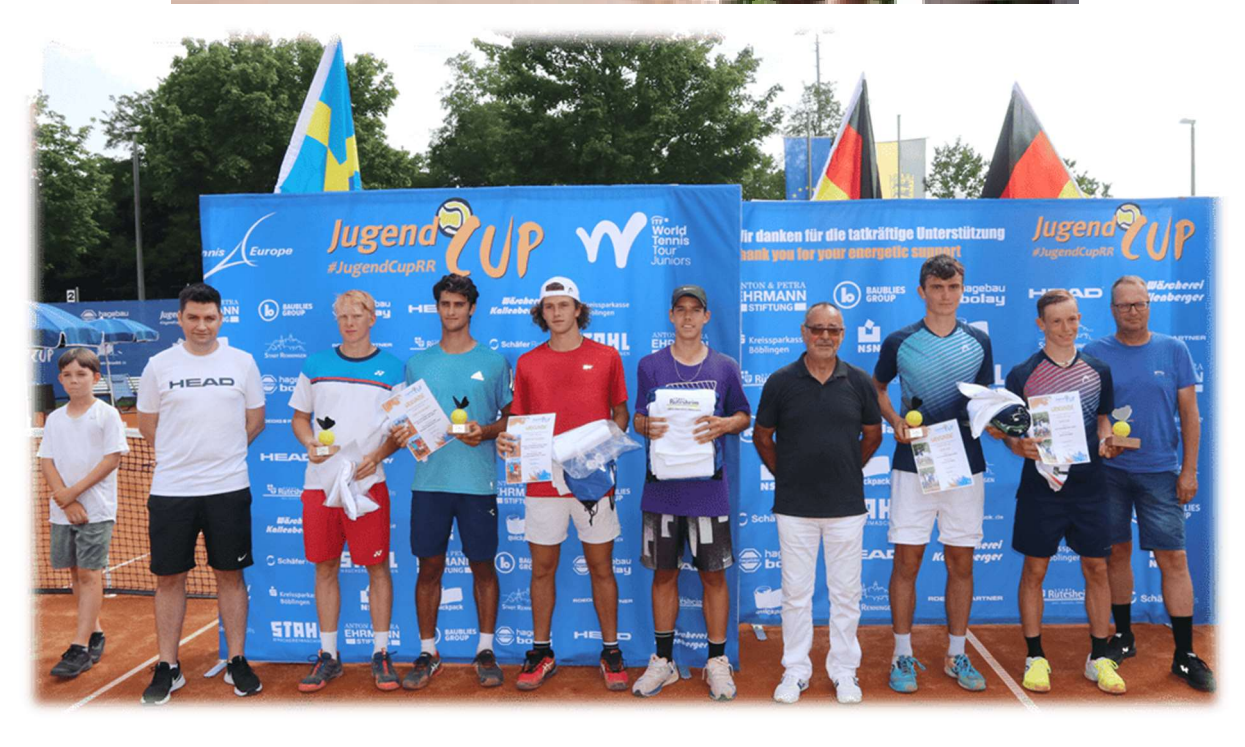
Welcome to the 2023 Baublies Jugend Cup